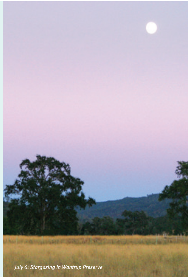
July 6: Stargazing in Wantrup Preserve